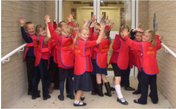
Peer Listeners at Lound Infant School

A group of Year 2 children at Lound Infant School are now trained to support others when they have got a problem. They can now skilfully offer their help by listening to both sides of the problem and work with them to create a solution where everyone feels understood and valued.